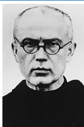
St Maximilian Kolbe