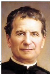
St John Bosco