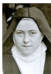
St Teresa of Lisieux