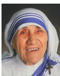
St Teresa of Calcutta