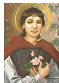
St Rose of Lima